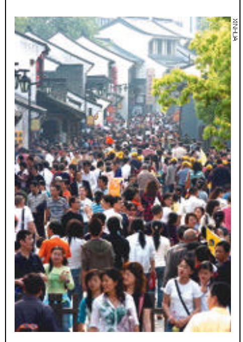
HOLIDAY MIGRATION: Major cities with tourist attractions in China witness extraordinary holiday migration twice a year during the National Day and May Day holidays

In 2006, the tourism sector registered 620 billion yuan ($81 billion) in revenue from 1.39 billion individual Chinese tourists, a year-on-year growth of 17 and 15 percent respectively. For the first time, the growth of domestic tourism revenue exceeded that of GDP.