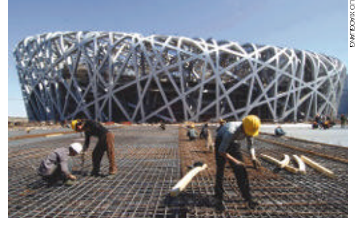
GROWTH STIMULUS: Compared with Olympic venue construction, such as the bird's nest-like National Stadium in this picture, Beijing is likely to face much greater challenges in terms of evading the "post-Olympics bubble"

The Olympic Games is generating some very important business opportunities mainly in two sectors. The first is the building and renovation of competition venues and other facilities, where the latest scientific and technological achievements will be widely applied. This will eventually promote the technological progress of related