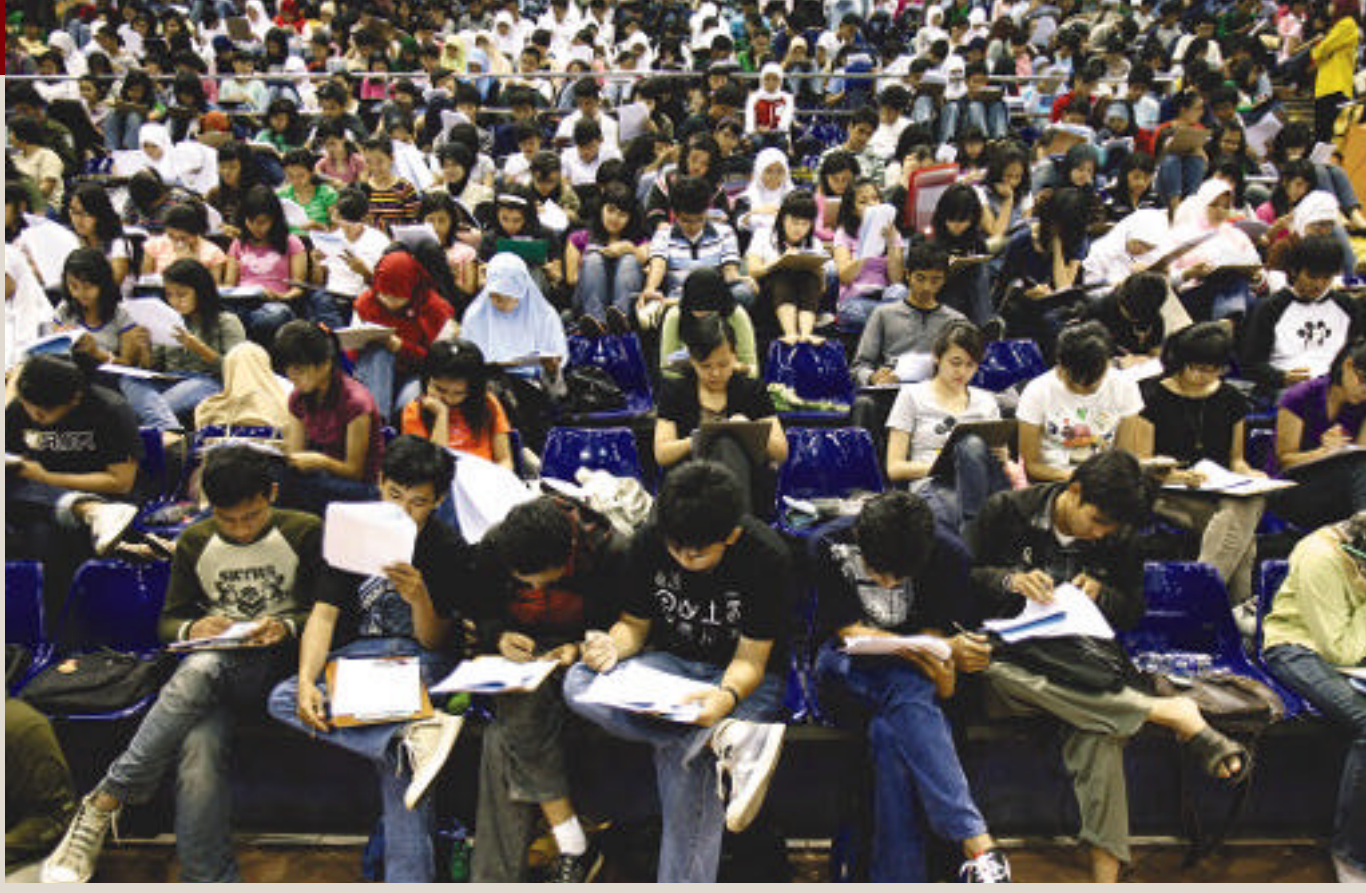
PREPARATION FOR EXAM Indonesian students sit for an entry exam for state universities in Jakarta on May 23. Thousands of Indonesian high school students were taking part in the exam to ensure their place in the state universities across the country