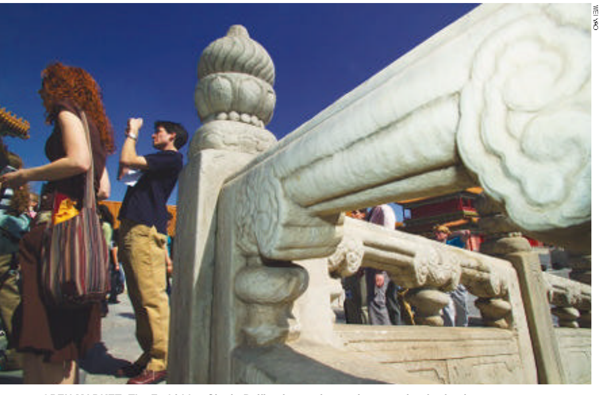
OPEN MARKET: The Forbidden City in Beijing is a major tourist attraction for foreign guests