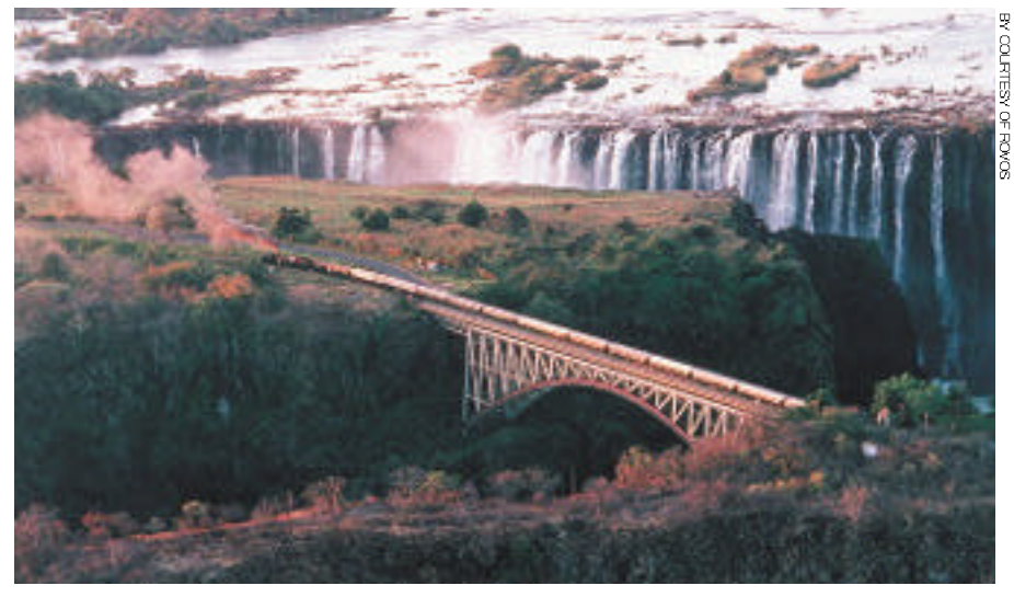
GRAND TOUR: Chinese tourists begin to enjoy luxury trips, and more than 40 Chinese have traveled with Rovos. Here the luxury Rovos train crosses the Zambezi River near Victoria Falls in Zimbabwe

The consumption capability of Chinese travelers has largely been improved. "Ten years ago when we traveled to Europe, we dared not buy too many things and spend too much because we felt the prices were too high for us," Ren told Beijing Review . "But now we feel it's OK, for example, to take a taxi which costs some 10 euros."