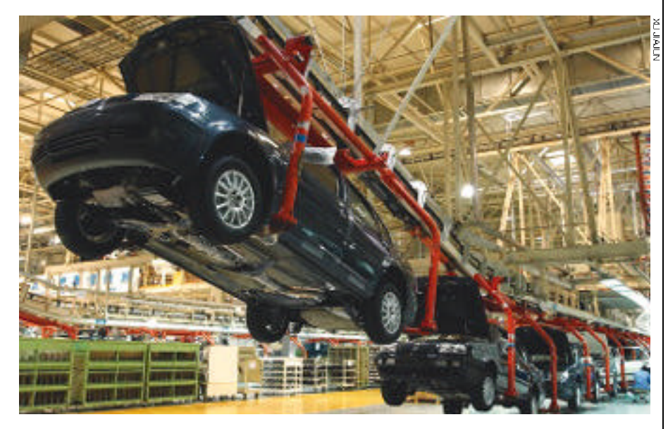
MEGA AUTOMAKER: Cars roll off the assembly line of FAW-VW Automobile Co. Ltd. in Changchun, northeast China's Jilin Province. The country's current economic soundness has been attributed to a general increase in the performance levels of Chinese corporations

This year opened with a 11.1-percent GDP growth in the first quarter, but maintained a low inflation rate and stabilized the consumer price index at 2.7 and retail price index at 2.1, respectively. It is noticeable that the government has dramatically reduced administrative regulations as overcapacity tensions are eased. Interest rate adjustments have become a more effective tool, especially after the listing of major state-owned commercial banks. A more rigorous lending condition requires an increase of company capital in investment, and makes these enterprises more sensitive to such adjustments.