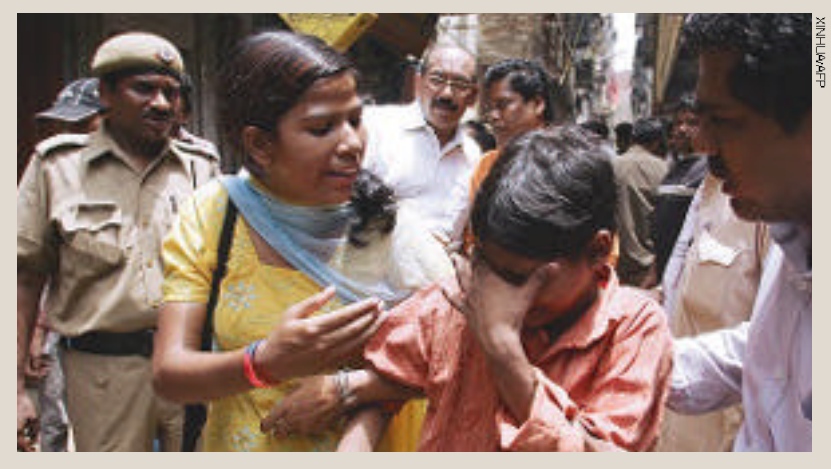
CHILD LABORERS RESCUED An Indian child laborer working at an embroidery and jewelry workshop is rescued in New Delhi on May 19. India has one of the highest percentages of child labor in the world, a source of income for poor families