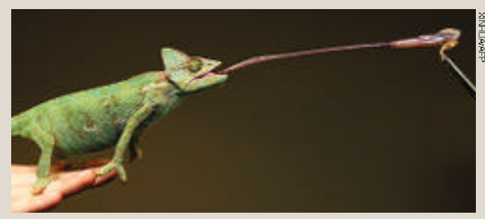
TONGUE CATCH A Chameleon extends its tongue and catches a cricket during feeding time at the Melbourne Museum