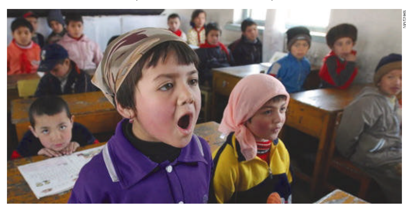
MAKE POVERTY HISTORY: An ethnic minority pupil answers a question during a Chinese class in a poverty-alleviation school in Urumqi, Xinjiang Uygur Autonomous Region