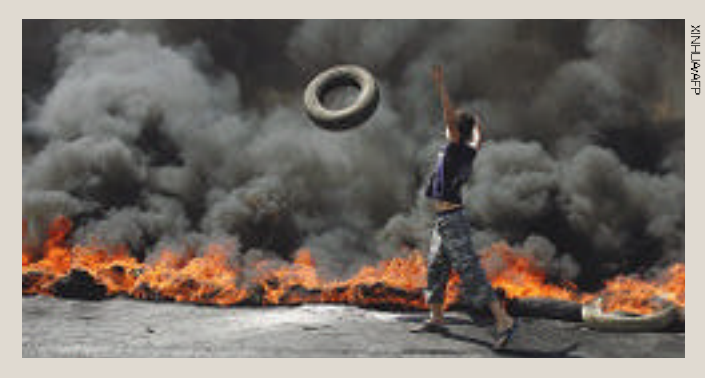
REFUGEE'S RAGE A Palestinian youth burns tires at the entrance of the Palestinian refugee camp of Bedawi adjacent to the besieged Nahr al-Bared camp in north Lebanon to protest against the continued attack by the Lebanese army against the Islamic militants of Fatah al-Islam on May 22