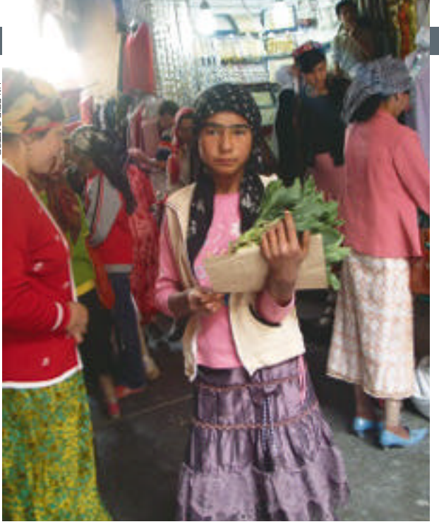
SHOPPERS DELIGHT: A child vendor in one of Kashi's eclectic markets, where anything goes

The author is an American teaching in Inner Mongolia