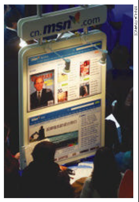
RUDDERLESS: Will e-magazines, or the digital presentation of traditional printed content online, ever discover a successful business model?

How to identify a profitability model that will get high recognition from customers while boosting the company's development? How to survive in an industry where content is king? How to provide better services and win more loyal readers to the e-magazines? These are burning issues for e-magazine websites.