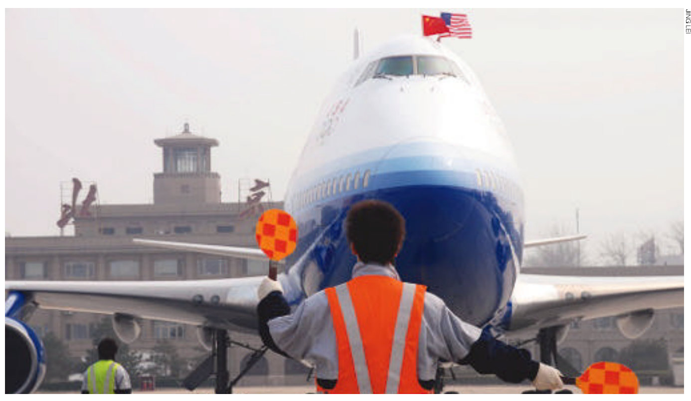
FLYING HIGHER: The first direct flight ever (United Airlines) from Washington to Beijing lands at Capital International Airport on March 29, 2007. An aviation agreement announced at the second round of the China-U.S. Strategic Economic Dialogue will double the daily passenger flights between the two countries by 2012

(With reporting by Corrie Dosh and Chen Wen from New York and Washington D.C.)