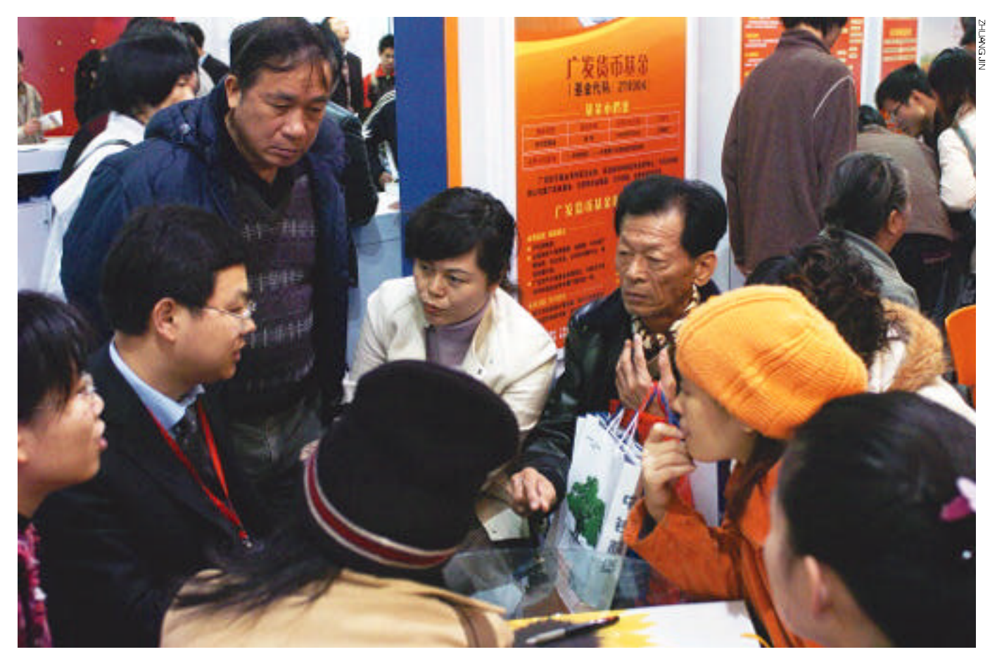
TO MAKE A FORTUNE: A fund manager with the Guangdong Development Fund introduces a new investment vehicle to potential buyers