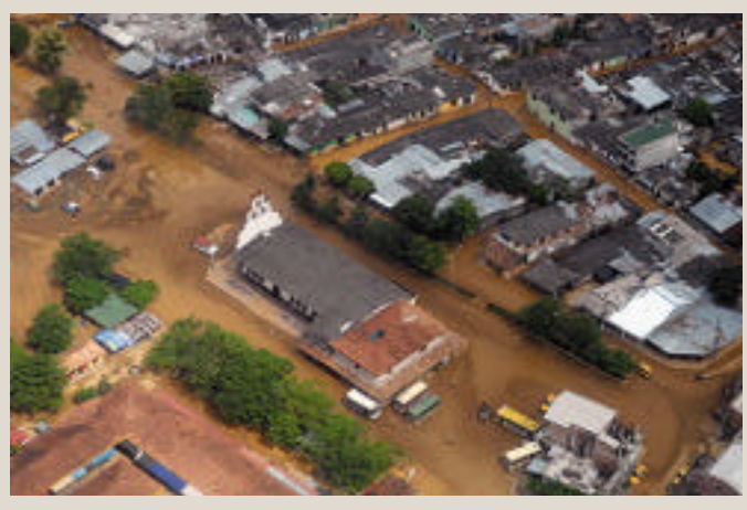
MUD-COVERED VILLAGE Aerial view taken on May 21 of the village of Taraza, Department of Antioquia, Colombia, covered by mud after being hit by a landslide. Seasonal rains touched off landslides that destroyed homes and fields forcing some 500 families to flee and leaving nine dead