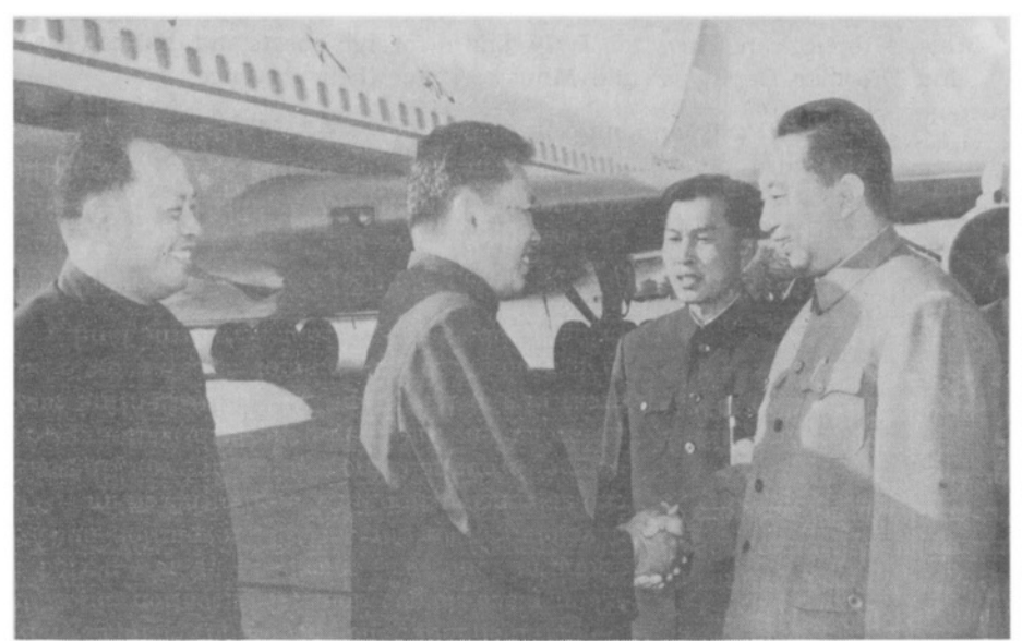
Comrade Hua Kuo-feng and Comrade Pol Pot at the airport.

banquet. (For full texts of their speeches see pp. 20 and 22.)