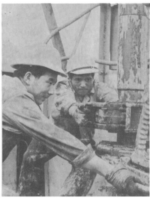
Working at a new oilfield.

In the last few months, our geological prospectors discovered indications of new oil and gas sources in some areas in the northwest, southwest and north China and off the coast. Their discoveries further verify