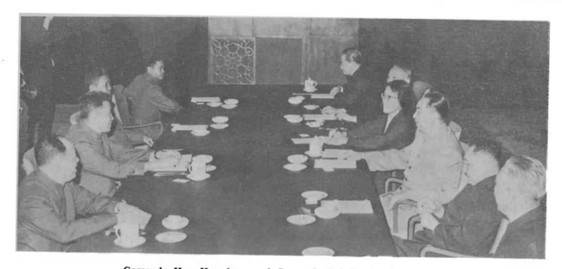
Comrade Hua Kuo-feng and Comrade Pol Pot holding talks,

The Kampuchean Party and Government Delegation headed by Comrade Pol Pot successfully concluded its official friendly visit to China and left