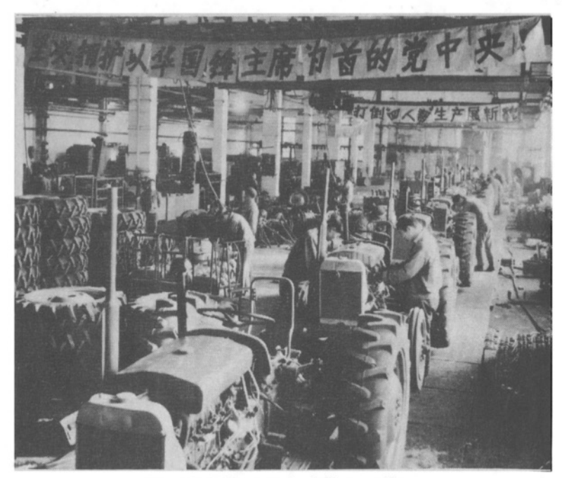
The plant is now in full operation.