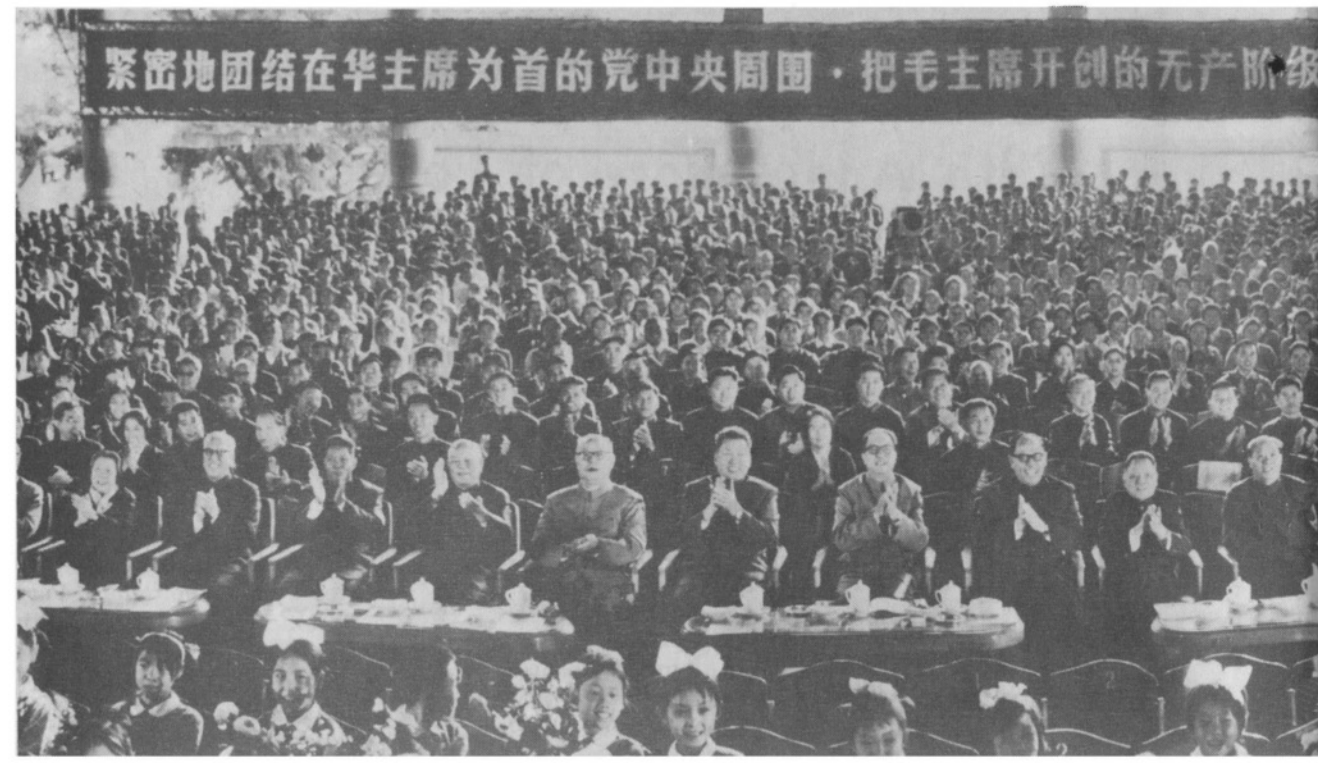
Chairman Hua and other Party and state leaders and the distinguished Kampuchean guests join the Peking citizens in celebrating the National Day in Chungshan Park.

they toasted the growing revolutionary friendship and unity between the Chinese people and the people of other countries.