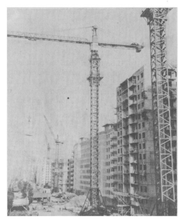
New housing project in Peking.

THIRTY-FOUR buildings 10 to 15 storeys high are going up simultaneously along a five-kilometre-long thoroughfare in Peking. This thoroughfare was laid a few years ago on the site of the ancient city wall which had been demolished. It runs parallel to Changan Boulevard