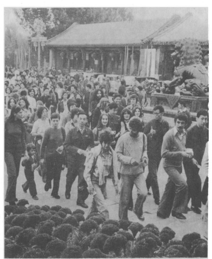
Comrades and friends from foreign countries take part in the gala celebrations.

Taking part in the gala gettogethers were workers, suburban commune members, P.L.A. commanders and fighters, intellectuals, cadres and students