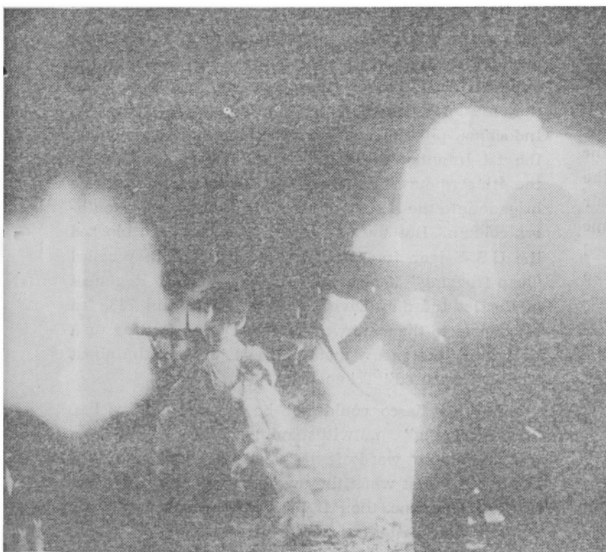
Attacking the U.S.-Saigon troops at the Khe Sanh front in south Viet Nam.