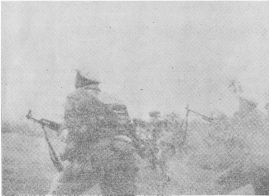
The Lao People's Liberation Army heroically wiping out the enemy.