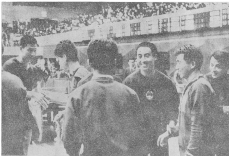
Chinese players chatting with players from other countries.

After the matches, the players from the Democratic People's Republic of Korea, the United Arab Republic and China encouraged and learnt from each other. The Korean players put the stress on playing their best at the championships, and at the same time learning from the players of other countries. Referring to the current championships, the Chinese players emphasized: "Wins and losses in contests are transient, but friendship is ever-lasting," and that since the strong has weaknesses and the weak has its strong points it is necessary to learn from each other.