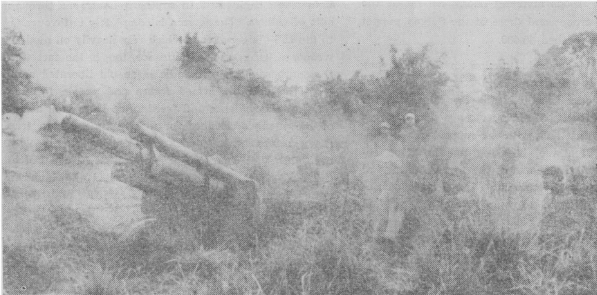
Lao P.L.A. artillery pounding the enemy on Hill 723.