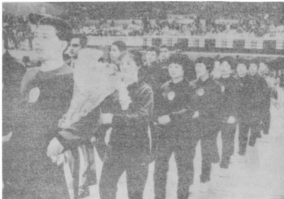
Chinese players entering the competition hall for the championships' opening ceremony.

Through five days of competition and other forms of contact, the players from five continents promoted