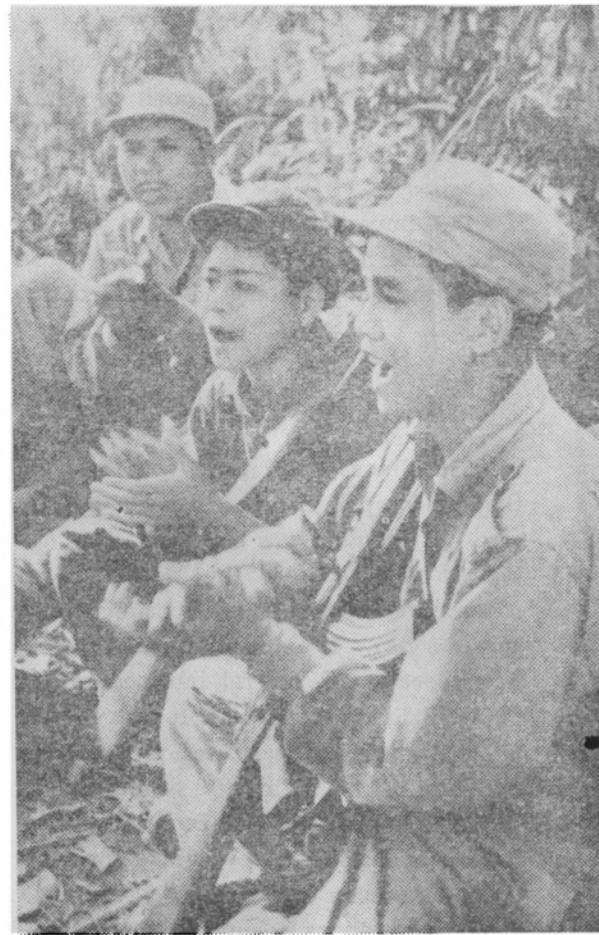
Lao P.L.A. fighters singing militant songs of victory at the battlefield.