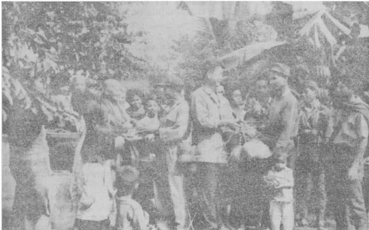
People of a liberated area in Cambodia warmly welcome the triumphant return of the fighters of the National Liberation Armed Forces.